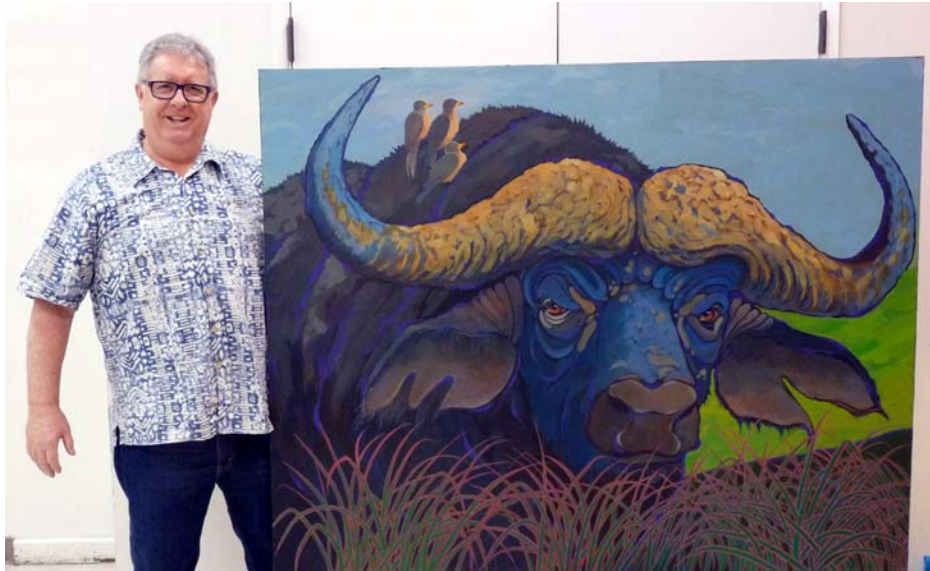
ADVANCED OIL/ACRYLIC First: Ken Church, Cape Buffalo Blue